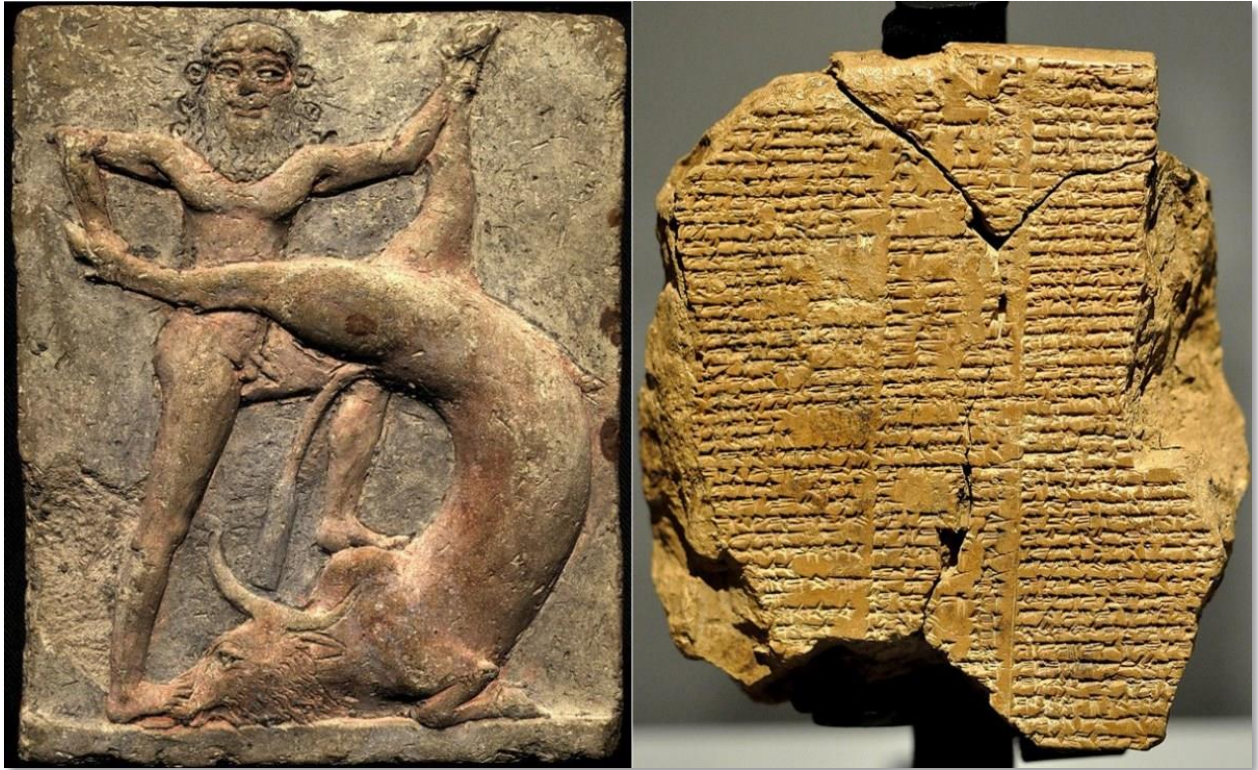
Ancient Mesopotamian terracotta relief (c. 2250 — 1900 BC) showing Gilgamesh slaying the Bull of Heaven, an episode described in Tablet VI of the Epic of Gilgamesh

Electronic Edition by Wolf Carnahan, 1998